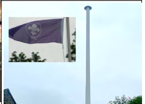
17. Flagpole by the building as you enter the site.