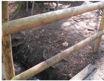
13. Entrance to the camp fire circle.