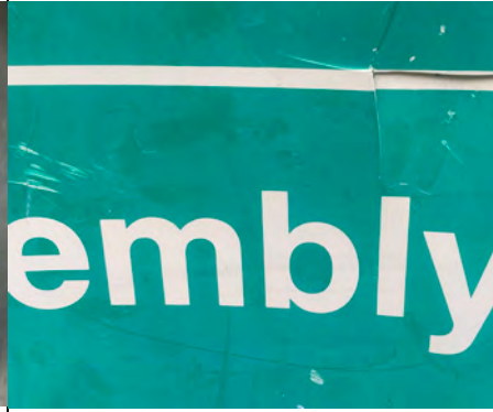
10. Fire alarm muster point on LHS of car park