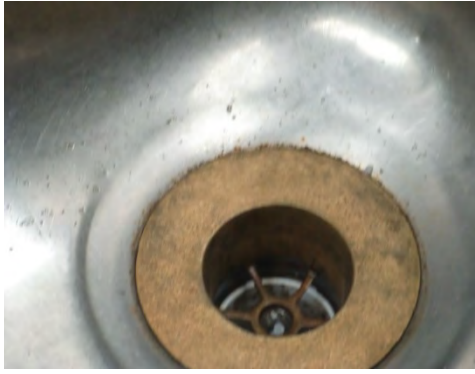
9. Sink in the washing up area by bottom field.