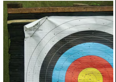
14. Archery range.