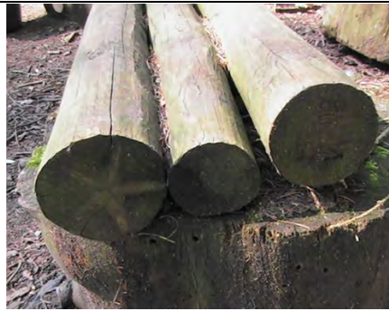
9. Fire Circle Seating