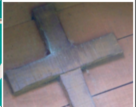
11. Cross on top of the Reflective Zone / 'Chapel' Shelter .