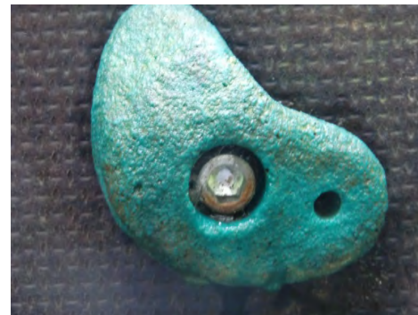
12. Part of the Traverse Wall